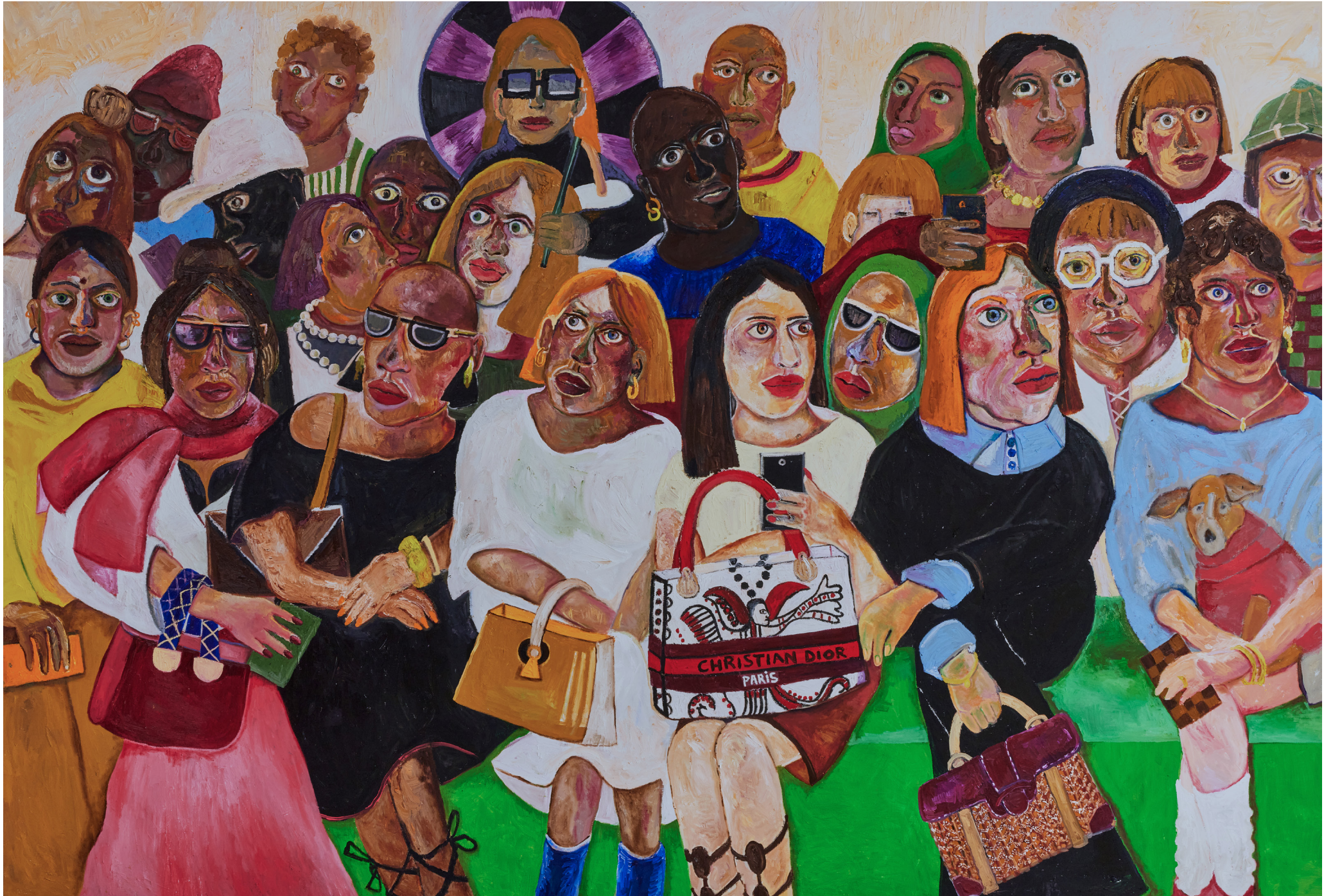
Runway, No Time For Your Opinion, 2022