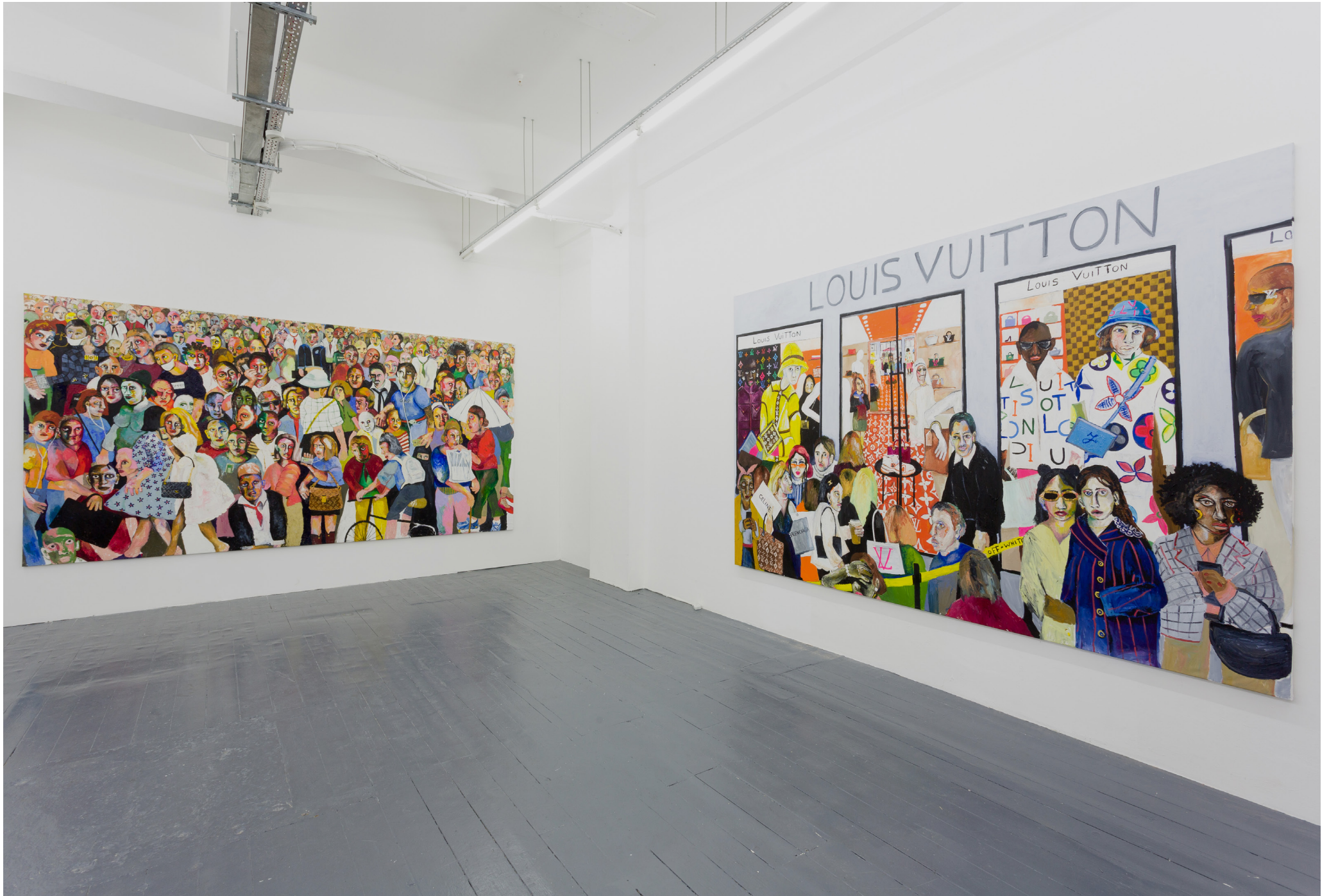
Gallery exhibition Pi Artworks London, 2021