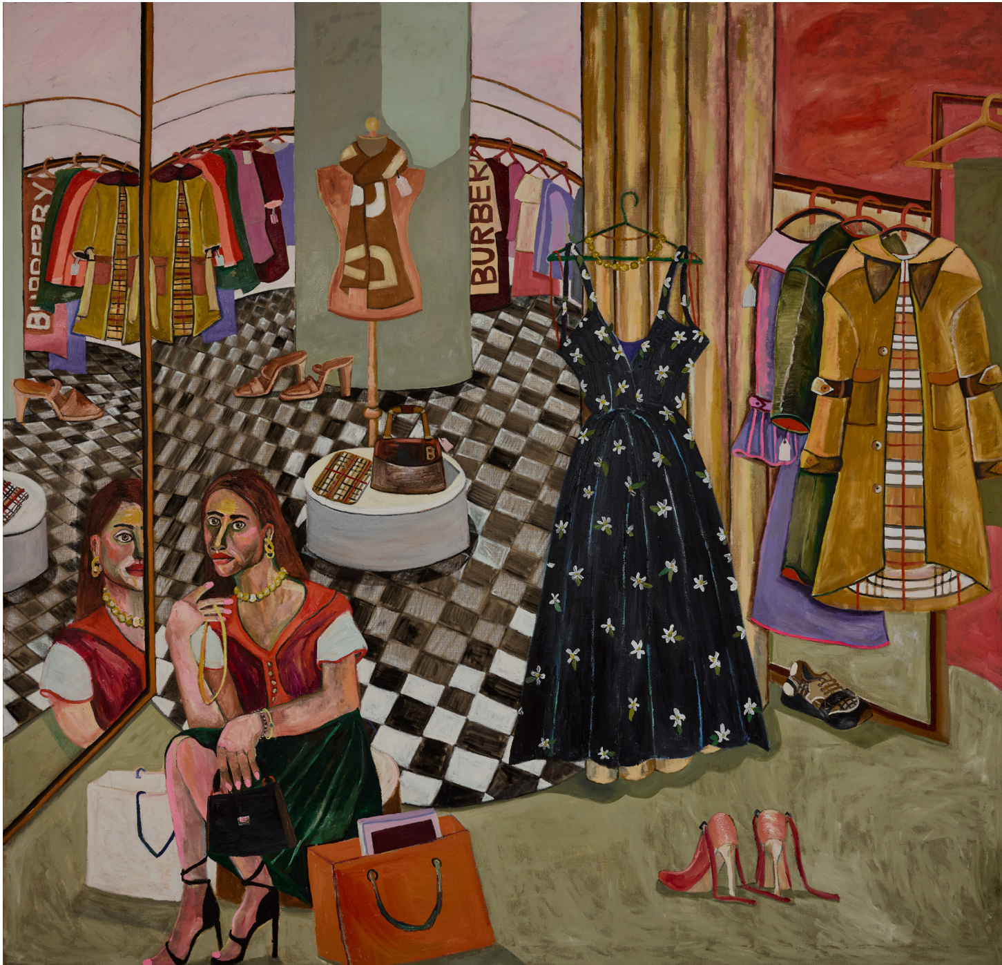
Dover Street Market, Burberry, 2023