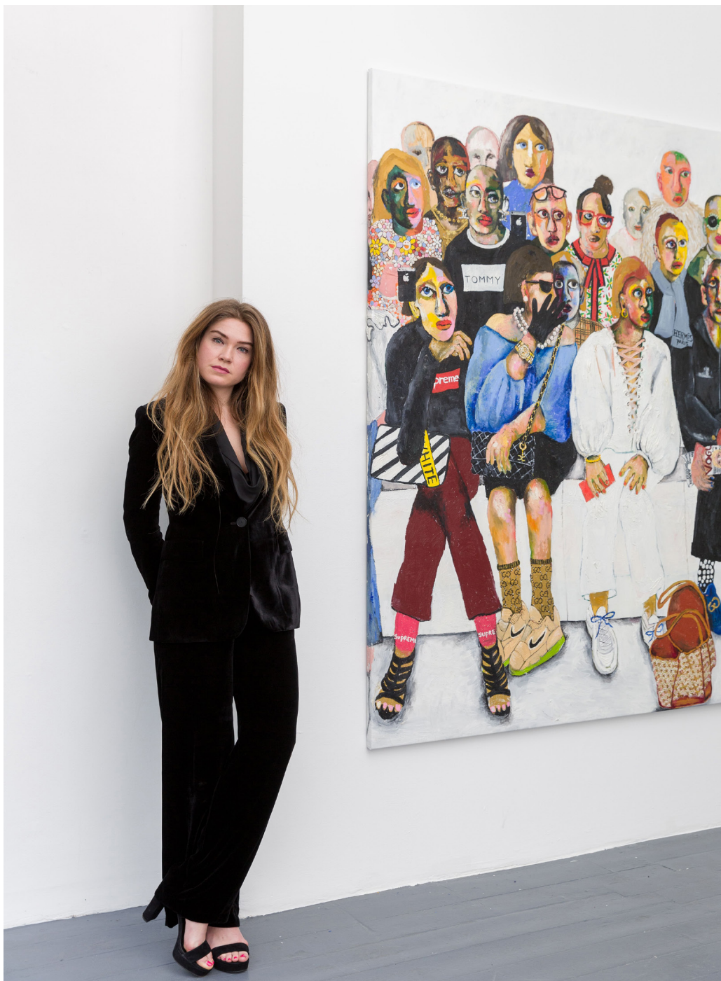
Portrait. Text by Foulques de la Grandiere