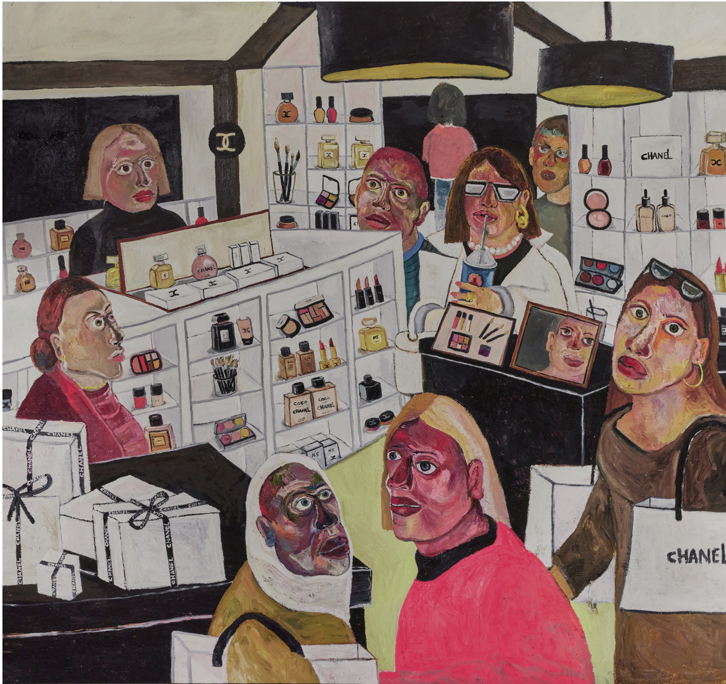
Chanel Store, 2022