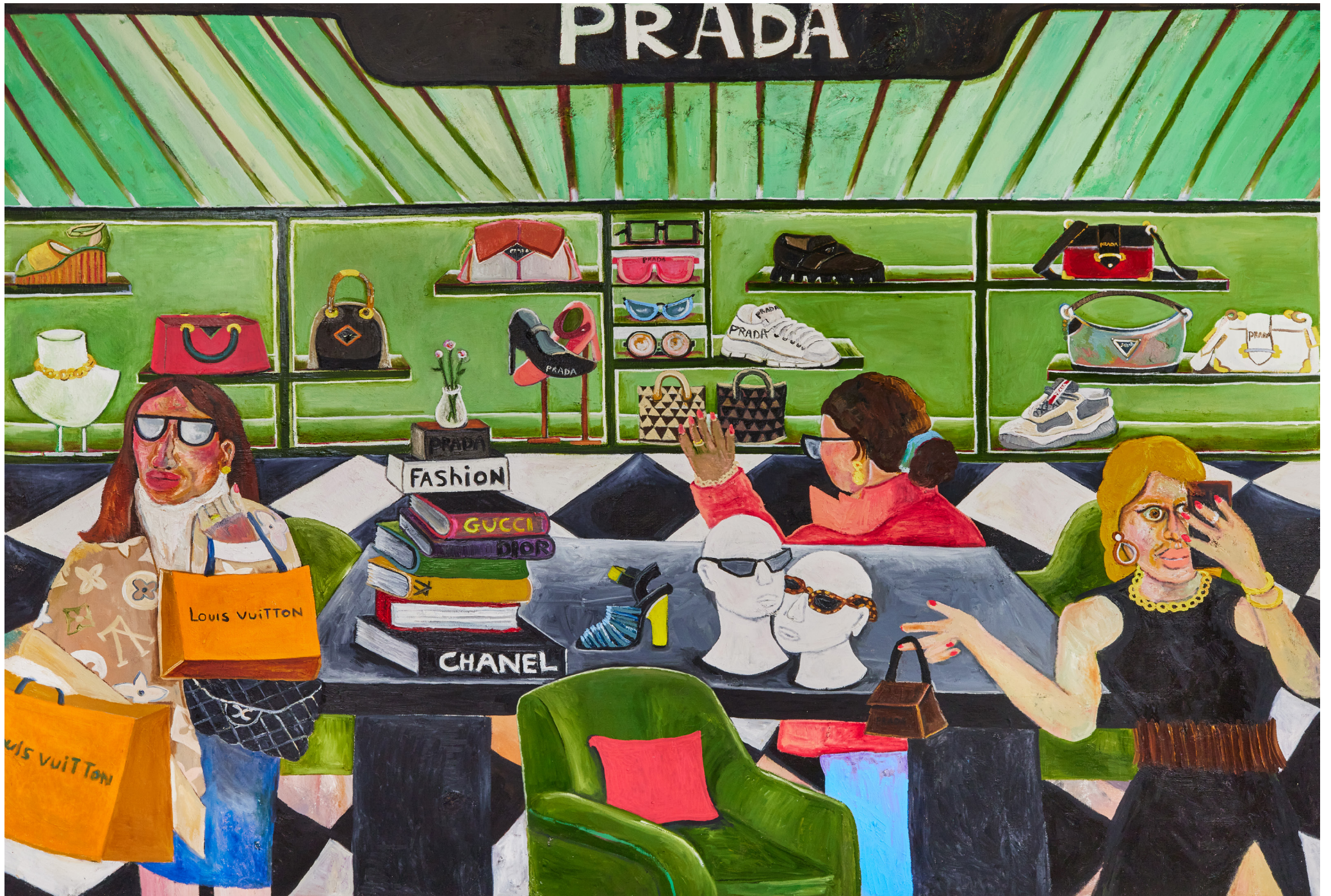
Be Seen, Be Heard, Prada, 2023