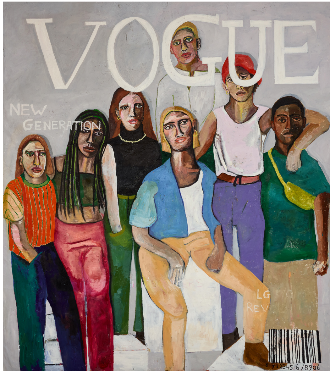
The new human, the new generation, 2023