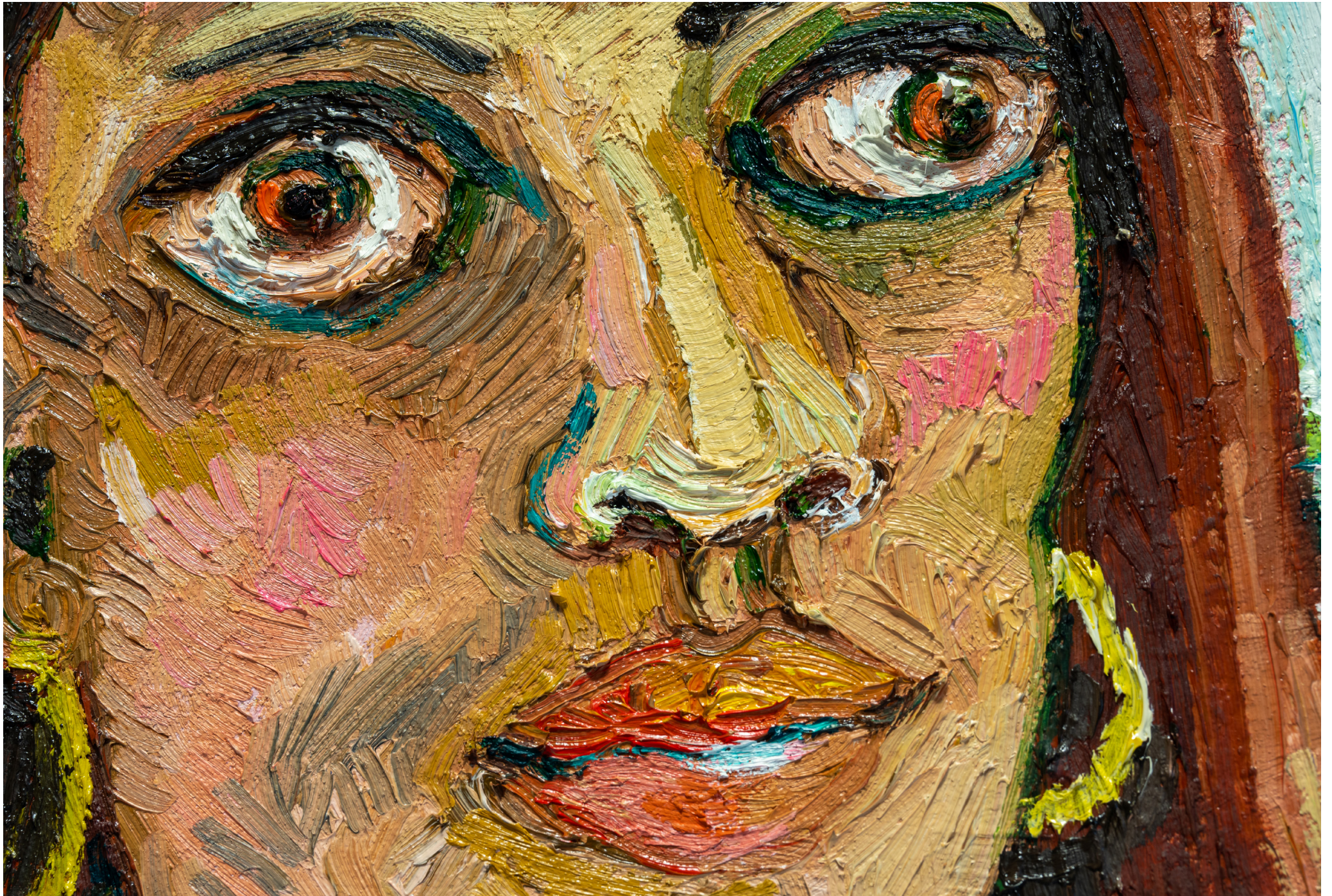
Patta Store detail, 2023