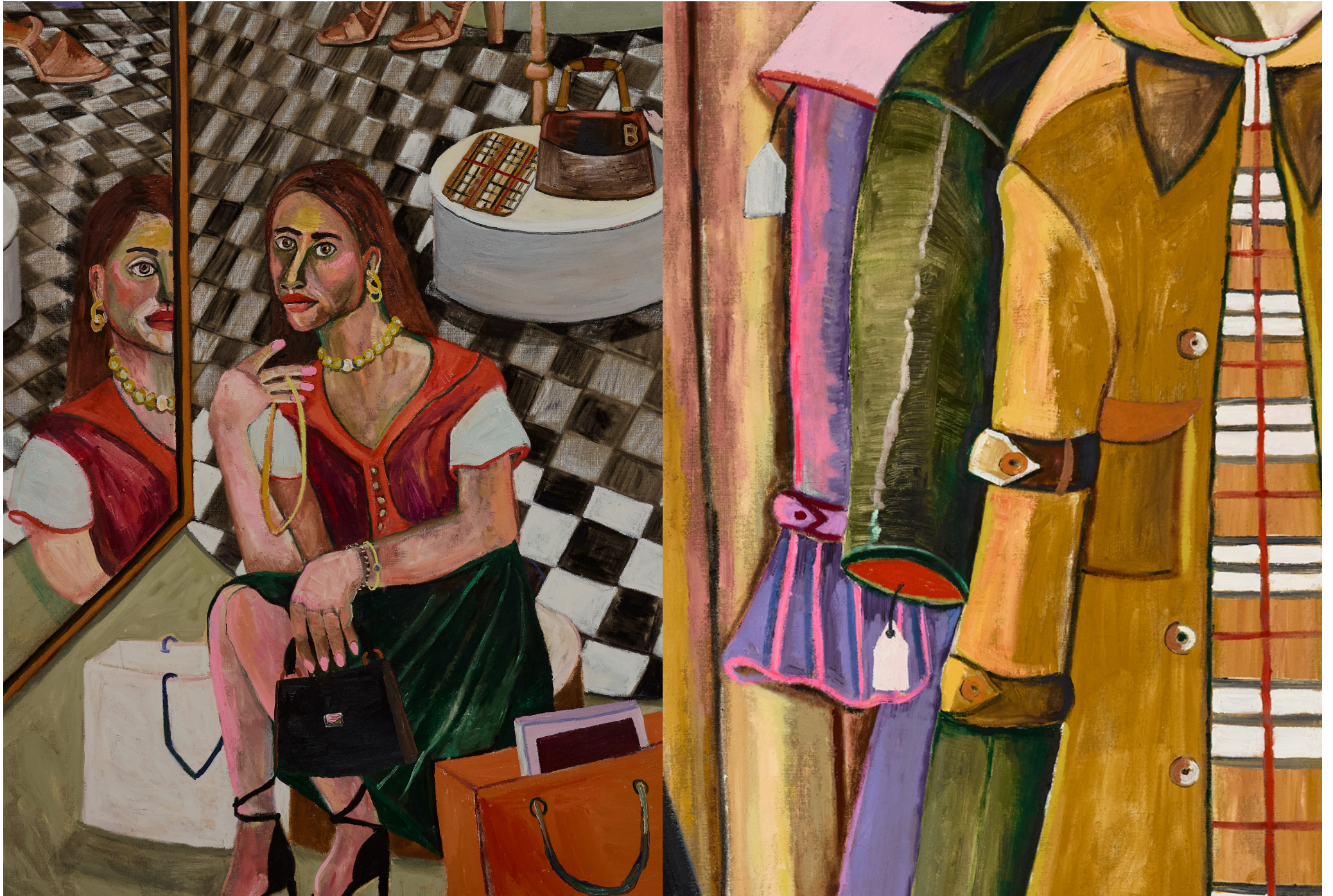
Dover Street Market, Burberry detail, 2023