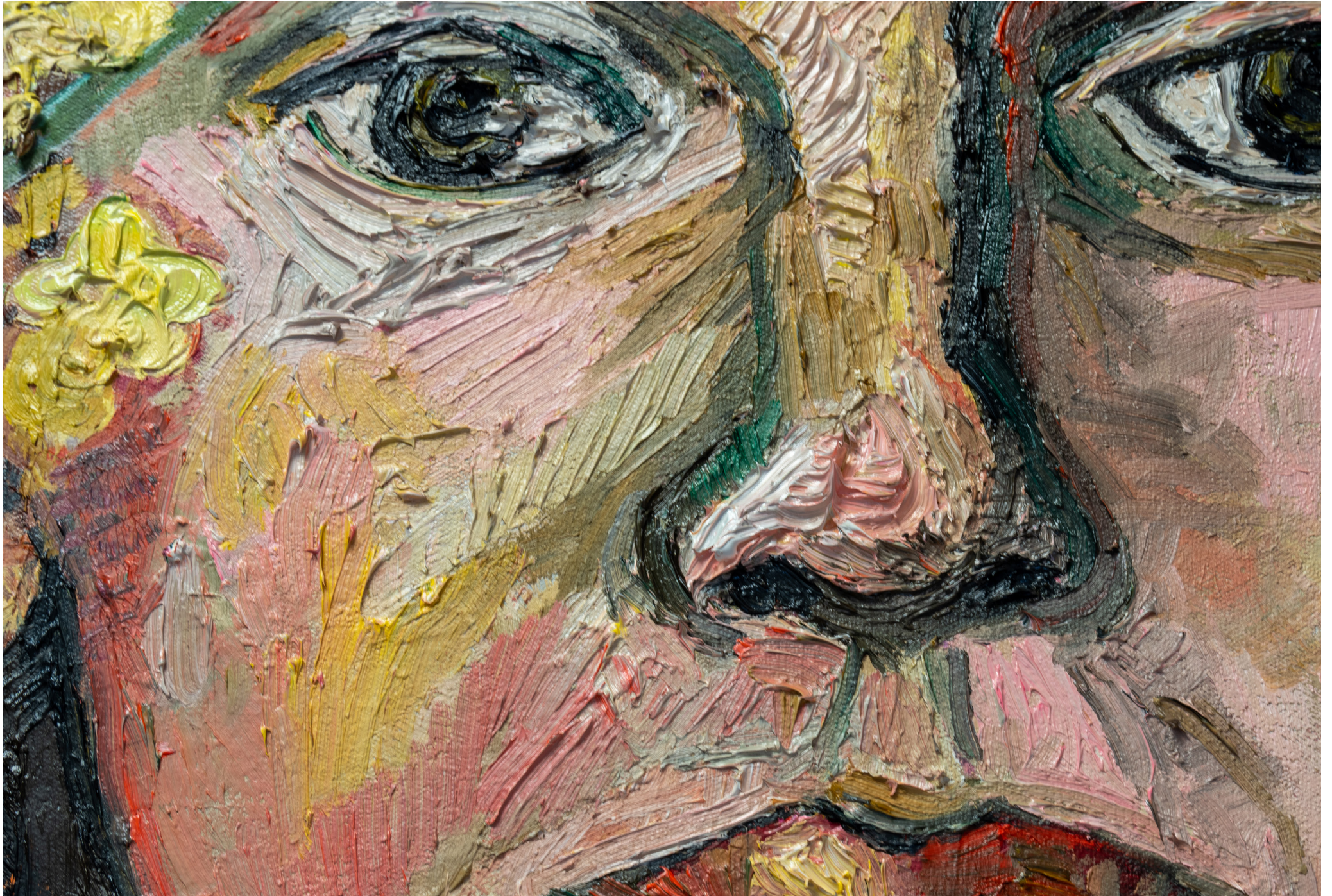
Close up of a painting in the studio, 2023